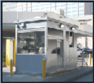
BI-LEVEL TRUCK INSPECTION BOOTH