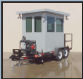
MOBILE BULLET RESISTANT WITH GENERATOR