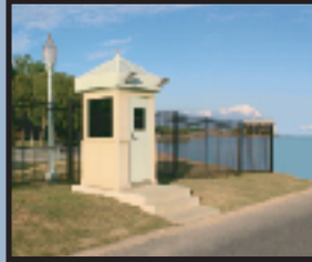
PAR-KUT SECURITY BUILDINGS FOR STRATEGIC ENTRY GATES AND HIGH SECURITY CHECKPOINTS