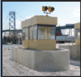
BORDER CUSTOMS INSPECTION BOOTH